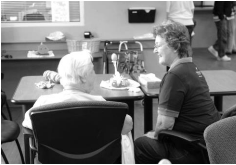
Let's turn aside, pondering what it means to "Live Generously."