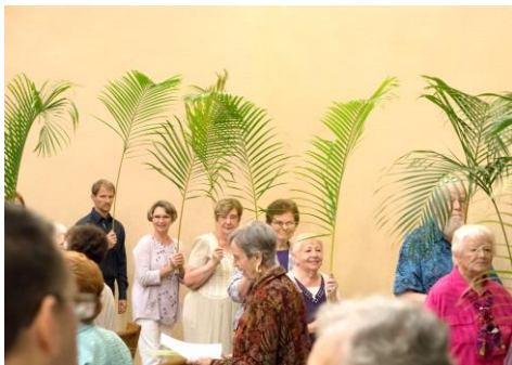
Worship with us during this season!